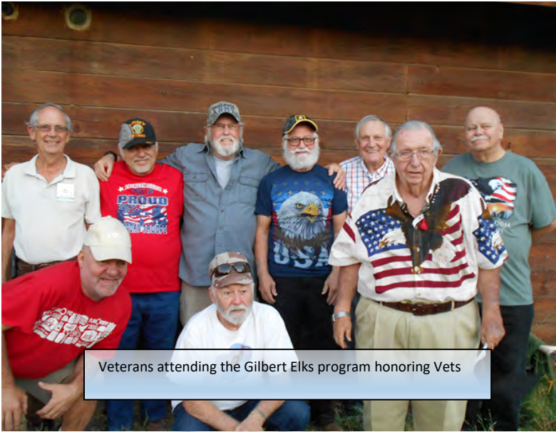
Veterans attending the Gilbert Elks program honoring Vets

Thank you for your service, To those who served overseas. To those who sacrificed everything, To those who kept me free.