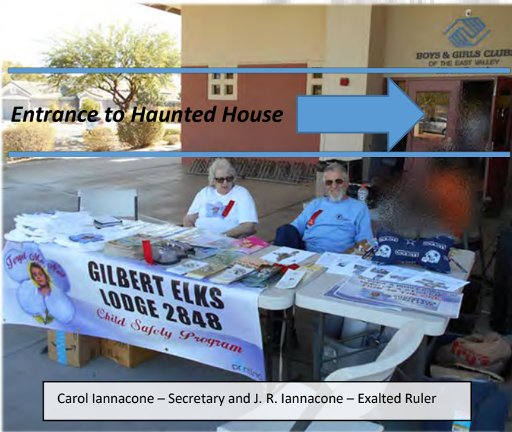
Entrance to Haunted House

The festival was well attended and we received good foot traffic inquiring about the Elks programs and the items we had on display. Especially popular were the "drug goggles" that showed what people saw when high on drugs.